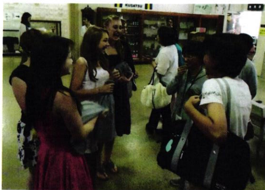
Montana students meeting Japanese students for the first time, Naganohara, Japan, July 2012

One of the ways we accomplish this is by an annual shared homestay experience with teenage students from both cities.