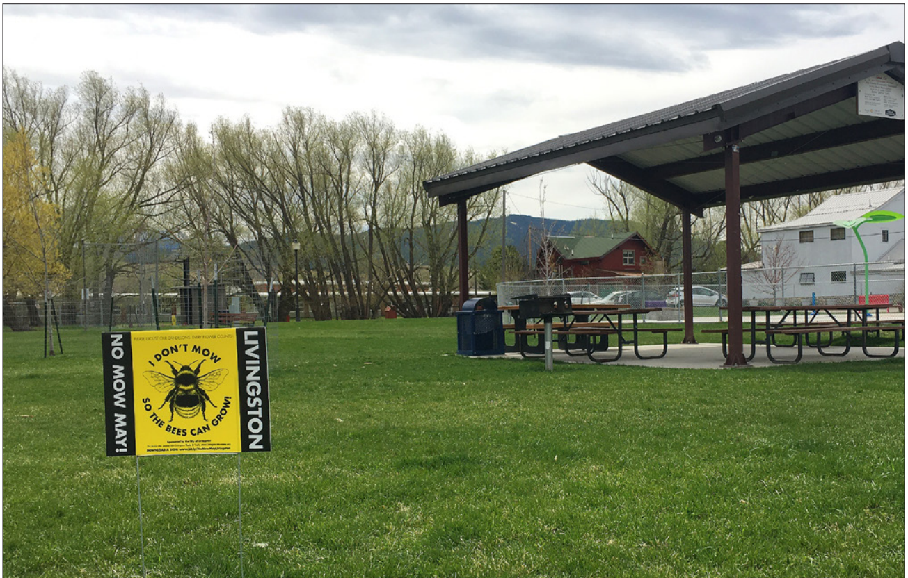
No Mow May signage at Mayors Landing