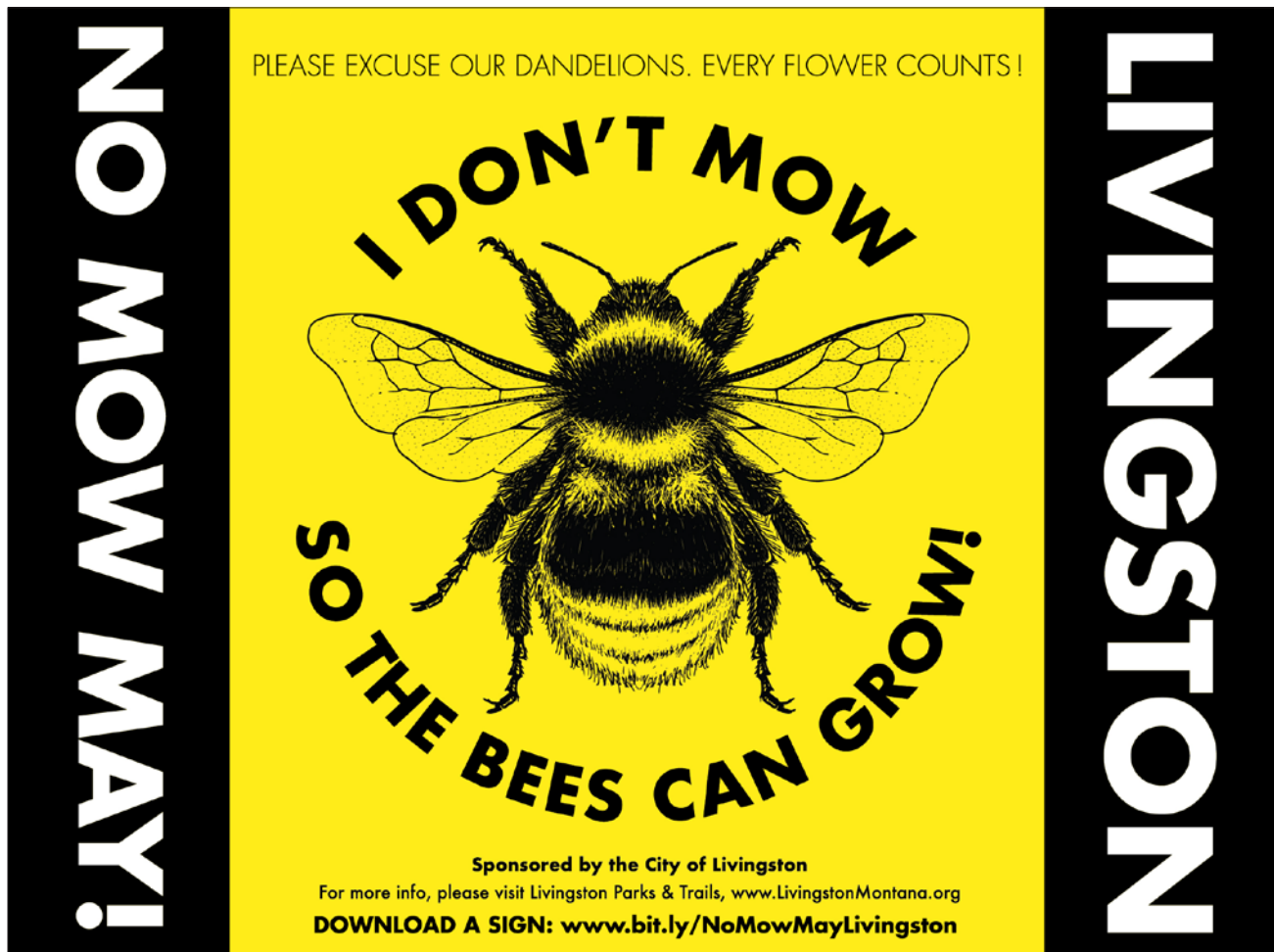
No Mow May signage was placed in designated locations throughout the City of Livingston, and a small amount was also provided for use by community members free-of-charge.

No Mow May test plots were located in Mars Park, Mike Webb Park field area, Mayors Landing and the former roping arena area, the Livingston-Park County Library, and along the Hwy 89 S bike path. Flyers were also passed out to local business. A limited number of yard signs were also available for residents who were interested in participating by not mowing their yards in May. The PTC hopes to continue this program in subsequent years.