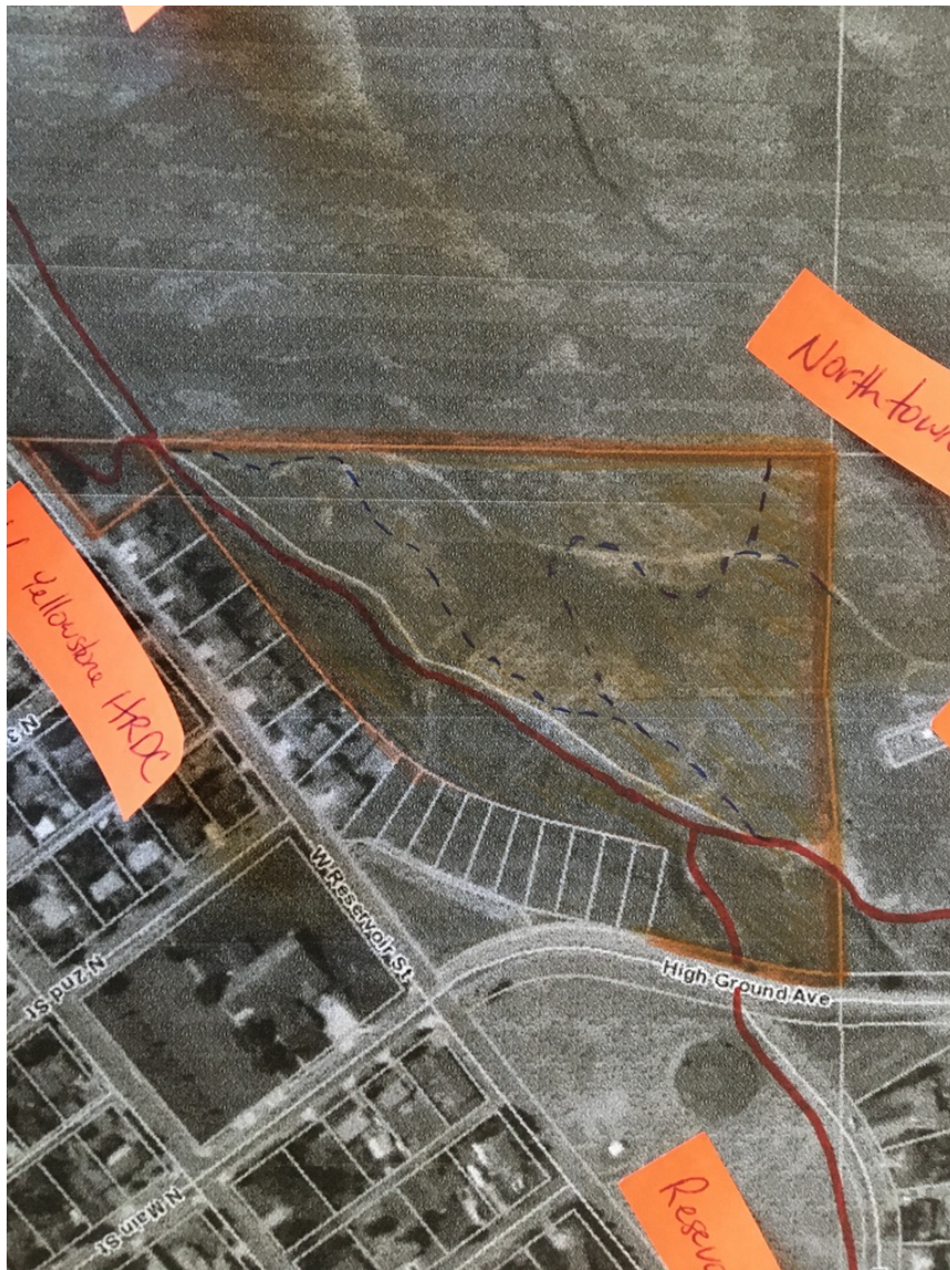
Figure 1 HRDC property highlighted in orange, the red line indicates priority trails and connectivity, dotted lines represent future opportunities for connectivity.