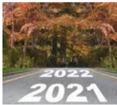
Looking Ahead to 2022