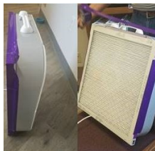
Air Quality Air-filter/Fan Units