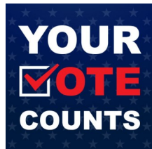
November City Ballot Initiatives